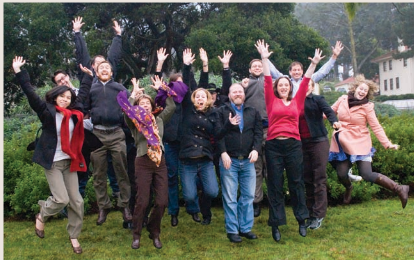
Center for Resource Solutions staff, December 2008

3Degrees Community Energy The Energy Foundation Georgia Power Neenah Paper New York Community Trust Nexant Nextera Energy Resources The Oak Foundation The San Francisco Foundation Sterling Planet Sunpower Sutherland TVA U.S Department of Energy U.S. Environmental Protection Agency Weaver and Tidwell Xcel Energy