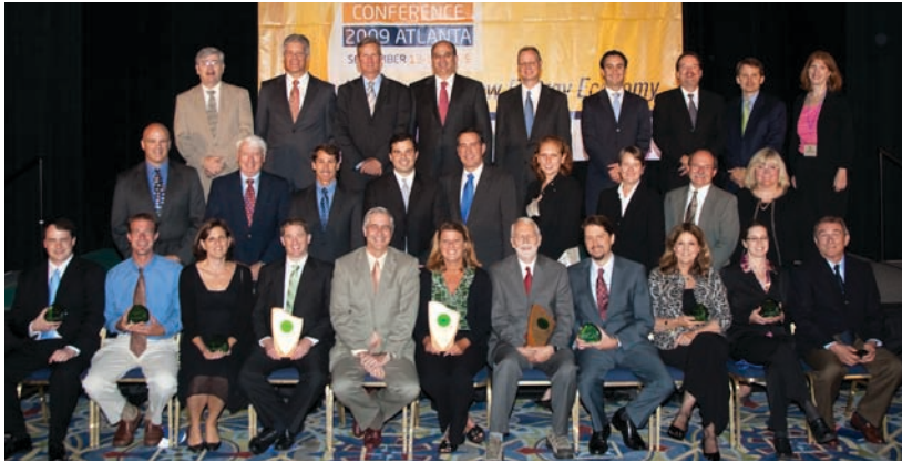
2009 Green Power Leadership Award winners