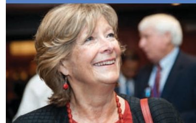
Photos of Renewable Energy Markets 2009