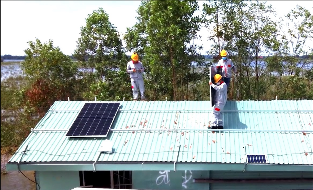
Solar panel installation at Tri An Village