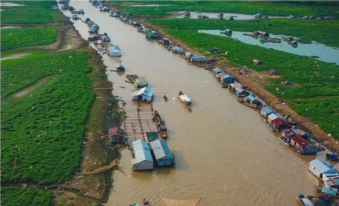
Tri An Village